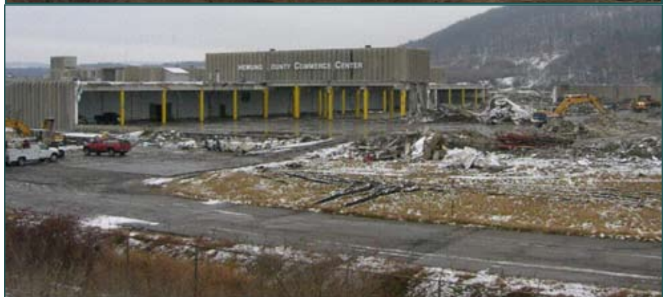
Former A&P Plant makes way for new shopping plaza.

Another perfect example is the former American Bridge plant in Elmira Heights. The 100-year-old factory, used to build structures like the Tappan Zee Bridge spanning the lower Hudson River, is now home to its fourth rail car manufacturer, CAF-USA, which has a 5-year contract to make rail cars for Amtrak.