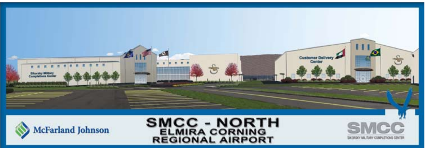
The former Warplane Museum is currently being renovated into a state-of-the-art facility for Sikorsky led by General Contractor Welliver, with Chemung County businesses John H. Cook Painting, Collins & Walton Plumbing, John Mills Electric, CME Associates and Hale Roofing also involved.

The unfortunate circumstances of these two troubled businesses turned fortunate for the expansion and redevelopment of the former museum into the Sikorsky Military Completions Center and Customer Delivery Center. The $12 million redevelopment project provides the company with 90,000 sq. ft. of much needed hangar space on the airport and 30,000 sq. ft. of administrative offices and support space for their international business as well as U.S. military business such as the unmanned Fire Scout program.