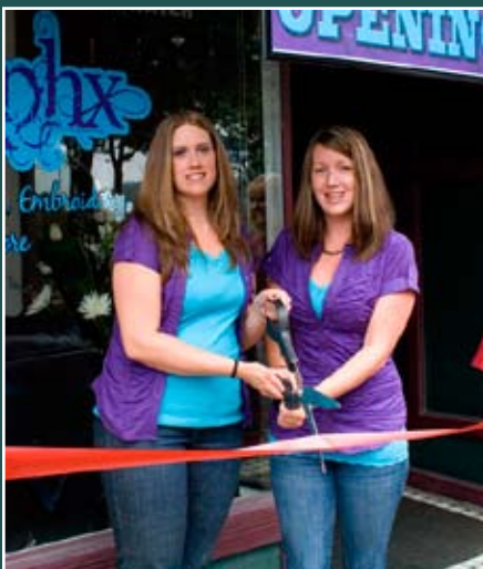
Grand Opening of Twin Graphx.

The small business loan, brought the total amount of Community Development Block Grant funds lent to businesses in the City of Elmira to $ 4.5 million since STEG started administering the City's loan program in 1995. While this loan to establish Twin Graphx leveraged a modest additional $75,000 in private investment and the creation of 3 new jobs, since STEG began administering the City's loan program a total of $51.3 million of private funds have been invested in the City. A total of 1,250 new jobs have been created to date, of which 724 have been filled by people of low/moderate income, a requirement of the federal grant program.