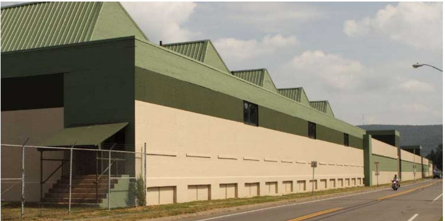
From 1935-1972 Remington Rand manufactured typewriters and employed thousands of workers in Elmira.

There are many more opportunities for this type of smart growth in Upstate New York, be it urban centers or vacant retail plazas, or tired old factories.