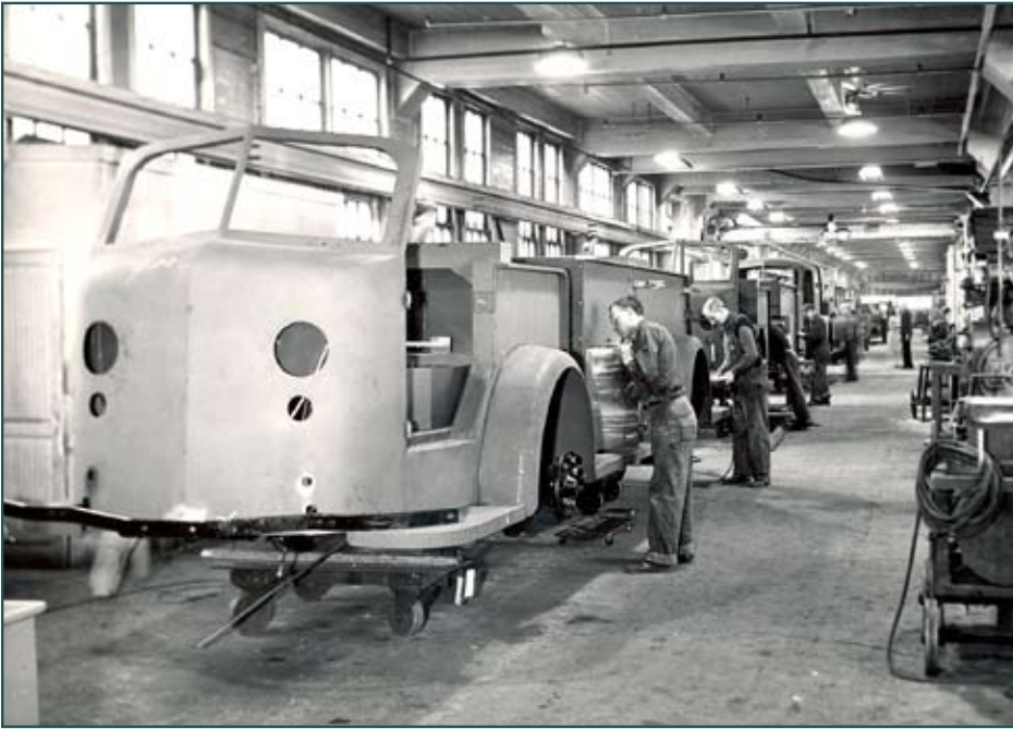
In addition to Remington Typewriters and adding machines, the Southport property was also home to American LaFrance Fire Apparatus for a period of time.

In 2011, two new “smart growth” projects are taking shape. In 1997, Chemung County won a competitive proposal to relocate the National Warplane Museum from Geneseo, NY to Elmira. The County constructed a $3 million hangar and facilities to