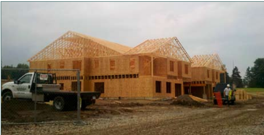
New Broad Street Apartments are under construction.

STEG commissioned an analysis of the Chemung County housing market by GAR Associates Inc. of Amherst, NY, confirming that the County's 1,674 multi-family apartment units have a 99% occupancy rate and that rent thresholds are rising. In the five multi-housing units and 35,000 single family units in Chemung County, approximately 32% of the residents are renters.