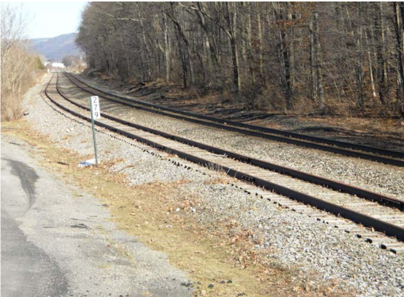
TRACK & SIDING (EAST)