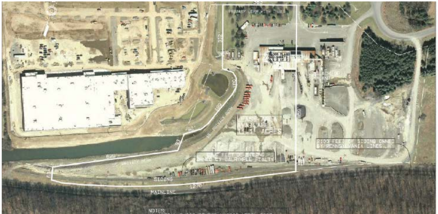
BOUNDARY LINE FOR AVAILABLE SECTION (IN WHITE)