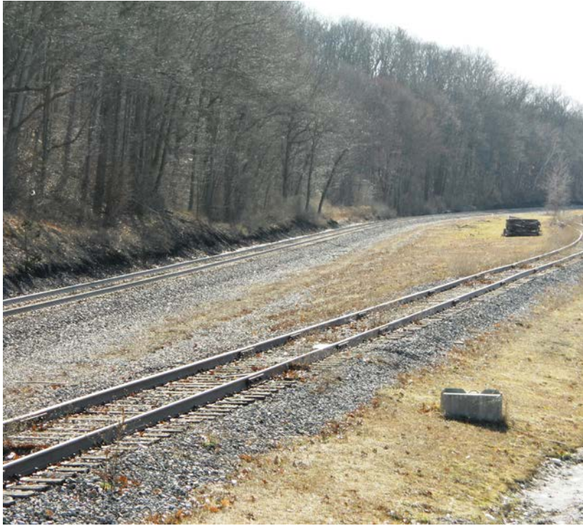
TRACK & SIDING (WEST)