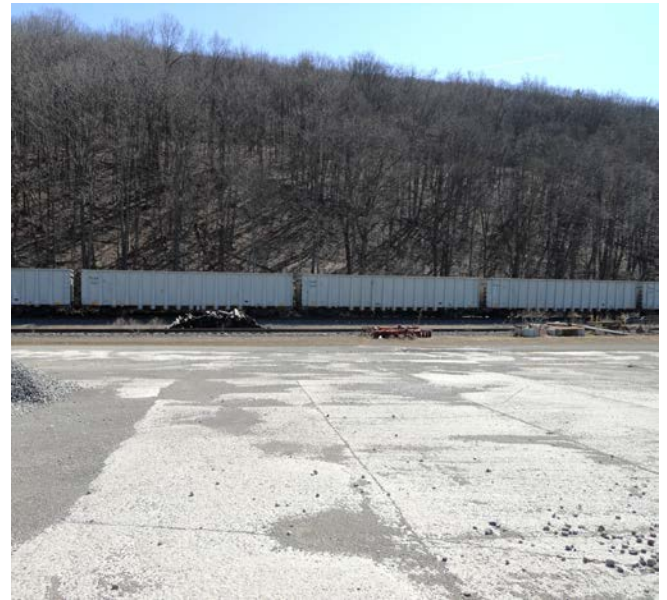
TRAIN (FAR VIEW)