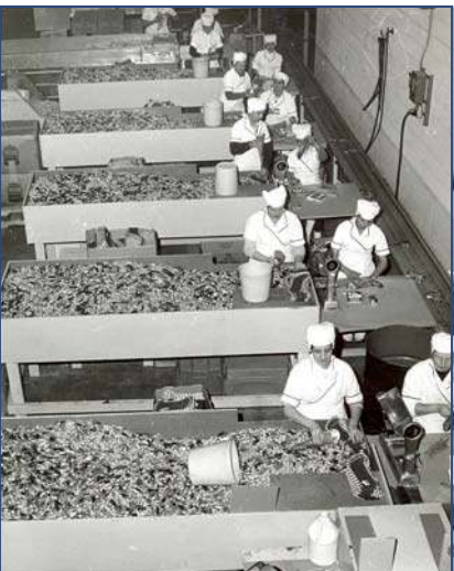
Once deemed the largest food processing plant in North America, the A&P facility was demolished in 2006 to make way for an 800,000 sq ft retail center.

people, when the company entered into a joint venture with Toshiba. The plant has undergone several expansions growing to its eventual 800,000 square feet.