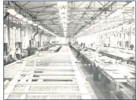
The former American Bridge Plant in Elmira Heights has been transformed into a rail car manufacturing facility and served as a base of operations for a number of companies in this industry through the 90's until CAF USA purchased the facility in 2001 making it their North American headquarters.

STEG has always been a private non-profit development corporation, but only in the past 25 years has the agency had professional staff to administer the agency's economic development initiatives of Chemung County.