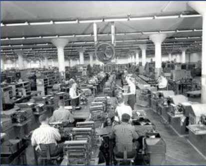
Remington Rand located in the former Wyllis Morrow factory in 1936 and occupied the facility until 1972. In addition to commercial products, the facility produced a number of defense related products through wartimes, most notable was the Norden bombsight one of the most important technological advancements to come out of WWII.