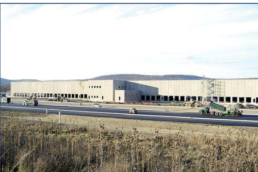
STEG's most recent accomplishment was the attraction of the CVS/Caremark distribution center to the White Wagon Road site in the Town of Chemung. It took nearly seven years to engineer and pre-permit the site, but the end result was a $91 million investment and 600 new jobs to Chemung

STEG, while often recognized for business attraction projects prides