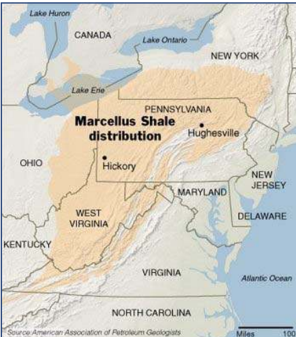
Penn State University geoscientist project reports that there is 489 trillion cubic feet of natural gas in the Marcellus Shale deposit, enough to meet the entire country's demand for 20 years.

Other companies such as Gas Field Specialists, Kayden Industries, Fortuna Energy, Mi Swaco, McJunkin, Red Man and Chesapeake Energy to name a few have selected areas of Chemung County to establish operations.