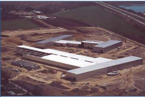
As the first Empire Zone Project in the State of NY, Vulcraft set the tone for STEG to develop additional shovel ready sites throughout the community. This paid off in February of 2009 when CVS announced the development of a 751,000 sq ft distribution center in the Town of Chemung, creating 600 new jobs.

The Airport Corporate Park, created in 1994, has attracted over $85 million in new capital investments and created over 1,600 jobs in the region with tenants such as General Revenue Corporation, Hunt Engineers, Orthostar, Avanex, Silicon Carbide Products, Provisions Modular Hardware, Fortuna Energy, X-GEN Pharmaceuticals, and others.