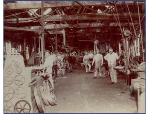
The Wyllis Morrow Plant located on Elmira's Southside manufactured one of the country's first automobiles until the plant closed in 1935. Elmira Industries was formed shortly after for the sole purpose of finding a new business to locate in the former factory.

In 1985, Chemung County's economy rebounded lead by STEG's leader-