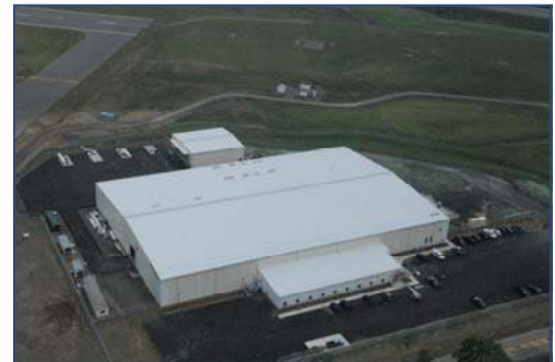
Sikorsky Aircraft expanded their operations in the fall of 2007 when they opened their Black-Hawk helicopter manufacturing facility in Chemung County. The facility manufactures specialized Black Hawk and Naval Hawk helicopters for the US and foreign military operations.

Leading growth around the Airport Corporate Park was the attraction of SYNTHES USA in 2001, which has grown to 340 employees, and most recently with Sikorsky Aircraft in 2006 which has created over 500 new