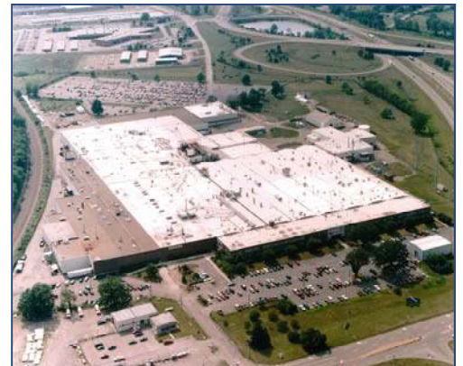
In 2006, STEG assisted with the retention of Eaton and over 200 jobs in the former Westinghouse building which helped leverage the sale of the building from Viacom to a private development firm.