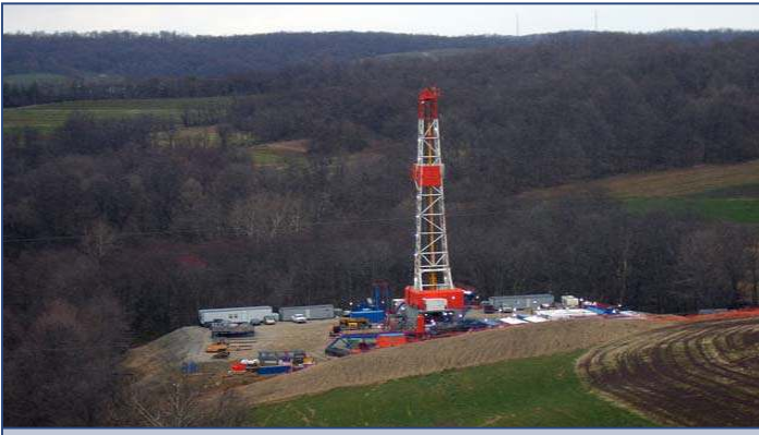
Schlumberger will provide a variety of services from its Horseheads campus to support drilling efforts at well sites. The Chemung County location was selected because of the available workforce and access to I-86 which will allow the company to serve customers in a 300 mile radius.

The Village of Horseheads recently approved site plans for a 400,000 sq. ft., $40 million gas field service